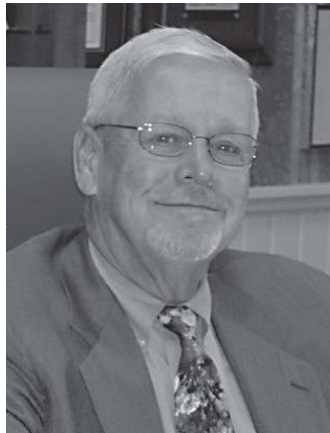
He is a Phoenixville legend.